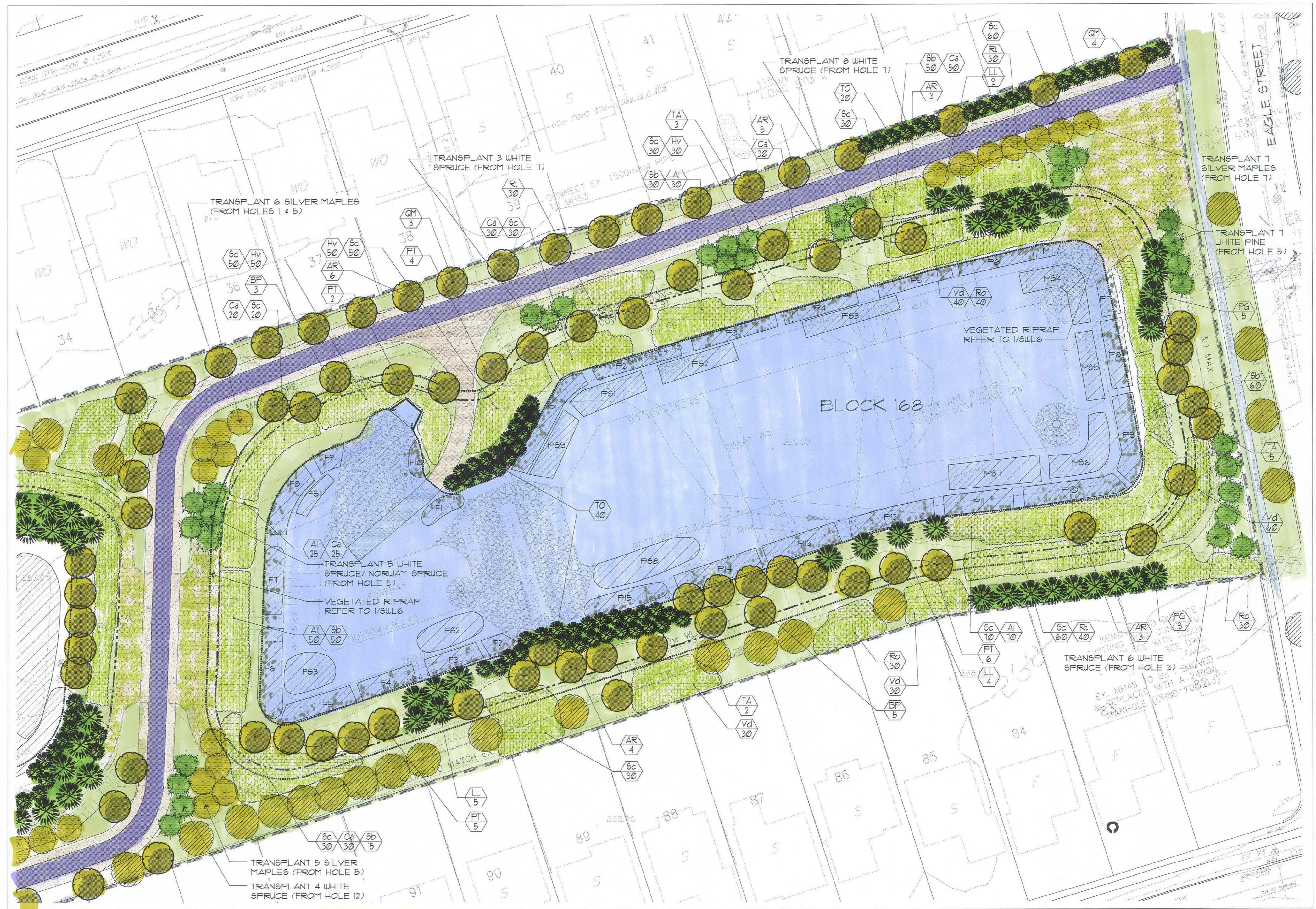
1 LANDSCAPE PLAN SULL3 SCALE: 1:400