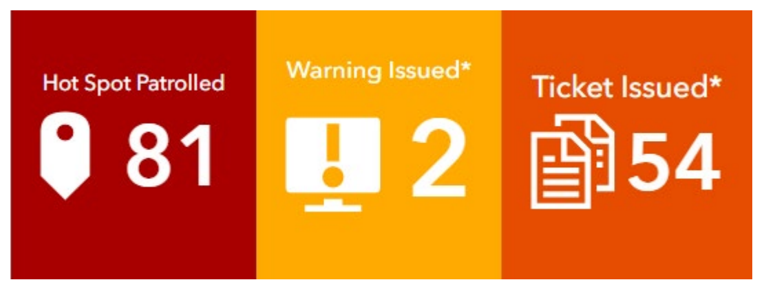
Table 1. Overview of proactive and reactive initiatives along Main Street South from Jan. 1 to June 30, 2021.

Throughout the first two quarters of 2021, MEOs remained primarily focussed on Covid-19 response initiatives. However, the following actions were taken in relation to Main Street South: