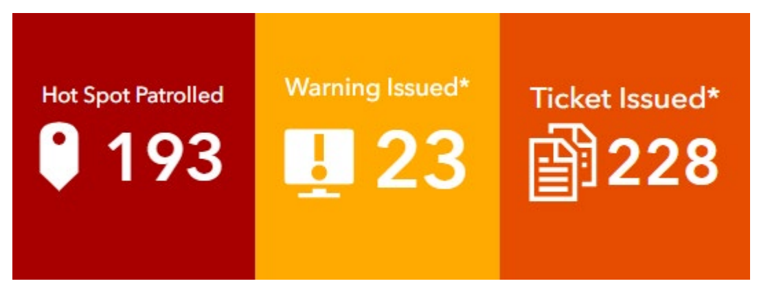
Table 2. Overview of proactive and reactive initiatives along Main Street South from July 1 to Dec. 31, 2021.

Throughout the remaining two quarters of 2021, MEOs transitioned into regular parking enforcement initiatives throughout Town. The following is a summary of actions taken in relation to Main Street South: