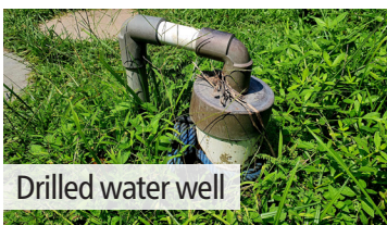
Drilled water well

A private water well is a self-contained water supply system, not connected to a municipal supply source, that provides water to a property. The well can look like a steel pipe extending into the ground, or a hole or pit in the ground, similar to the images below. Sometimes the well is buried, and you cannot see anything from the surface.