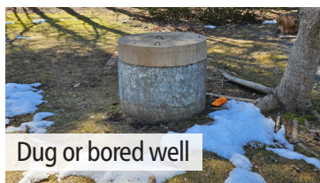
Dug or bored well