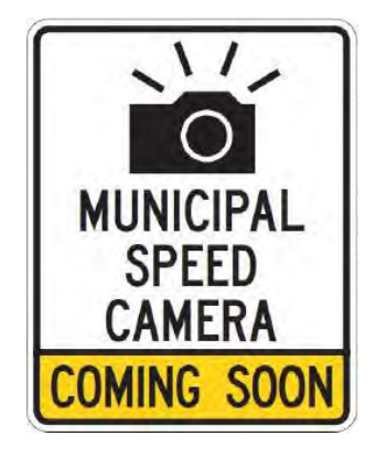
Figure 2 Automated Speed Enforcement Warning Sign

Utility locates have been obtained for all proposed ASE site locations to allow for installation of the warning signs in February to align with the proposed deployment schedule.