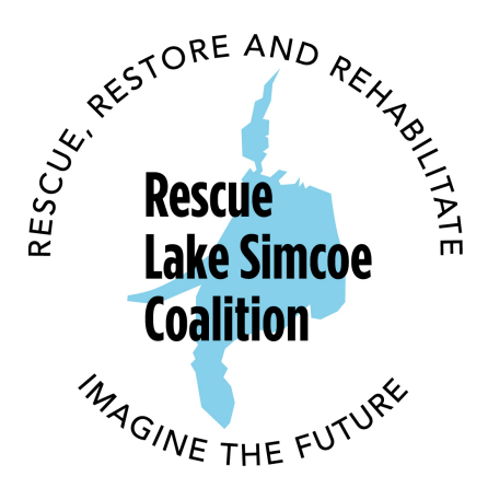
** Please circulate to all Council members. Thank you. **