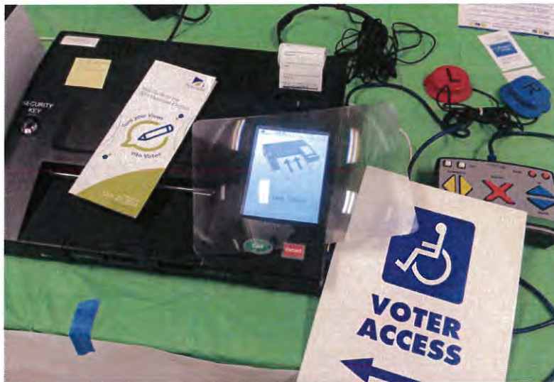
Figure 1: Accessible Voting Device

A printer attached to a Vote Tabulator is used to mark ballots in accordance with voter's ATI-recorded ballot selections for subsequent processing by a Vote Tabulator.